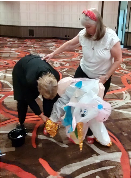
Everyone needs a little help now and again