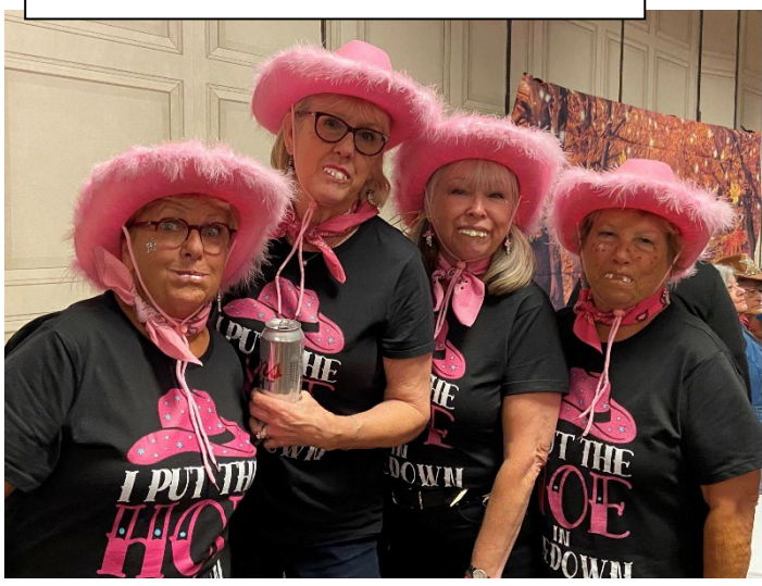
Visitors from PCC at the Hoe Down Saturday Night FNCC No Host