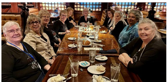
Convention Board – Dinner at the Oyster Bar