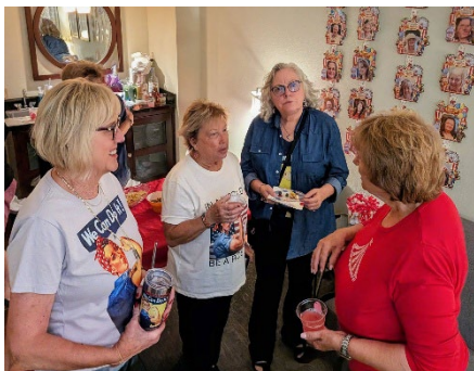
Looks like some serious conversation in the Bounce House! Convention 2026?

The "Ring Leaders", their Traveling Troupe, the Crazy Clowns, Midway Misfits and the FNCC Cracker Jacks traveled to Buena Park for the OCCC Visitation in November.