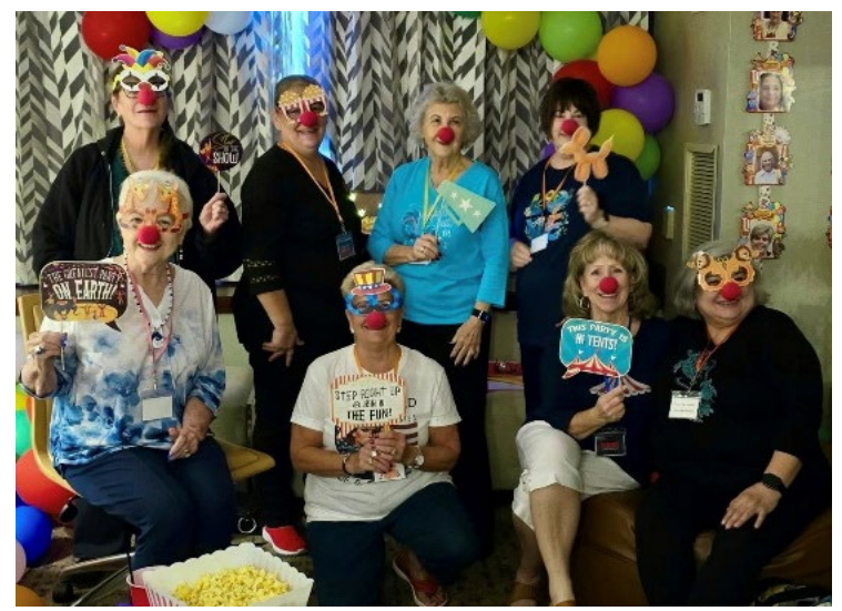
Are these really the Vice Presidents?