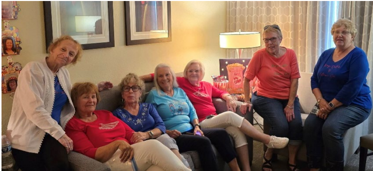
I found most of the "Troupe" out of costume and taking a break.

Whew! What a whirlwind Septe Clowns, Midway Misfits and the FNCC Cracker Jacks! They have all been traveling up and down the State of California. It seems that they may be slowing down after the Intra-State meetings and the FNCC October Brunch in Sparks, NV., at the Nugget Resort October 2-5, 2025. My guess is a much- needed respite is in store.