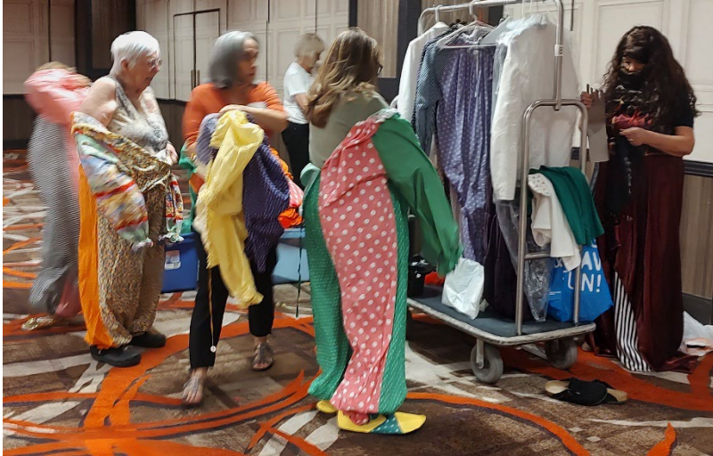
Behind the scenes chaos. Getting ready for the 2026 Convention Skit.