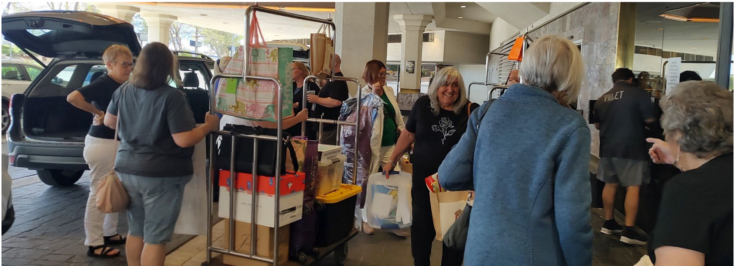
Even when we are leaving, we have a good time