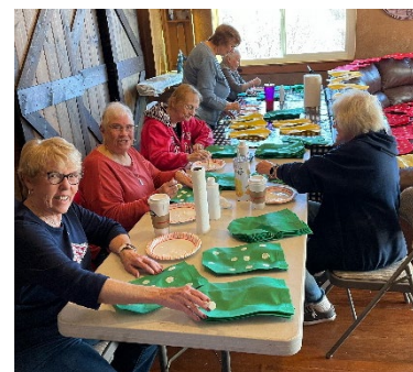
Work Party for 2026 Convention

2026 CONVENTION BOARD IS HEADED TO PCC FOR OUR FINAL VISITATION! Next Stop Sparks, Nv.