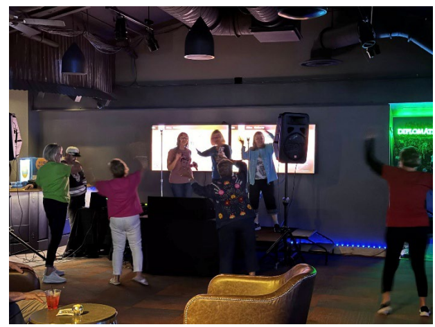
A little Karaoke is good for the soul