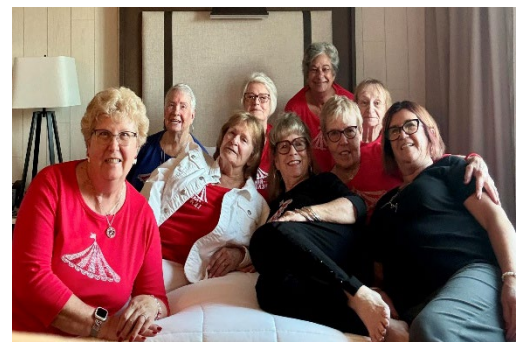
The Heart of the 2026 Convention Hanging out