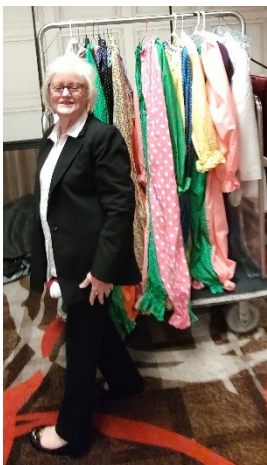
Does anyone know this clown?