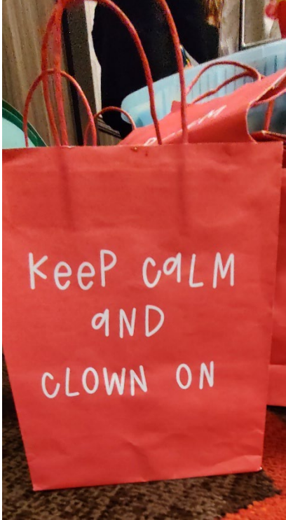
Words to live by!!!!